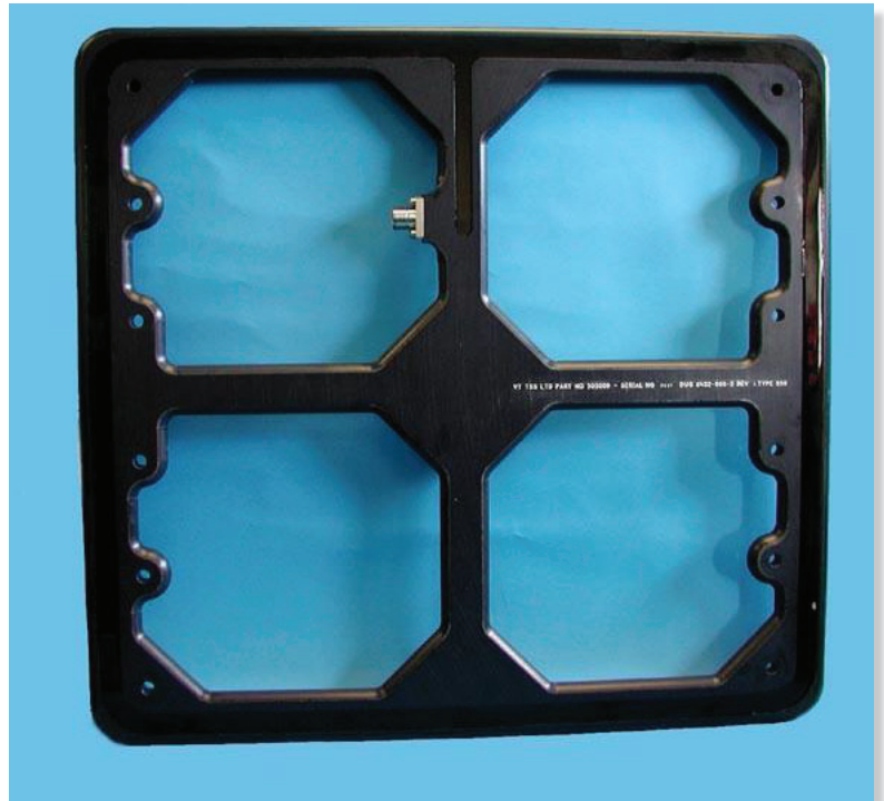
Polyurethane Elastomers and Primers

Encapsulated transducer elements and arrays requiring specific mechanical, electrical and acoustic properties from the encapsulant are manufactured to customer specification. Advice is available on special elastomer formulations for acoustic windows and absorbers. TI-PDM vacuum encapsulate units such as pipeline inspection modules which operate at pressures up to 5800psi.