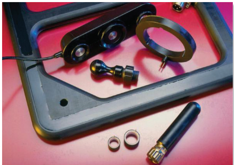
Piezoelectric and electromagnetic sensors

If you have a need for encapsulated or moulded products please contact TI-PDM to discuss your requirement.