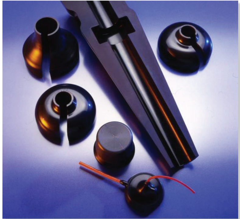
A selection of moulded products

Development work can be undertaken to enable production of multi-part mouldings where specific encapsulant properties are required for different parts of the assembly. This form of construction often results in a lower cost product with improved properties. With TI-PDM's involvement in the connectors it is frequently possible to satisfy customer needs in all areas of sensor/cable/connector termination, moulding & encapsulation.